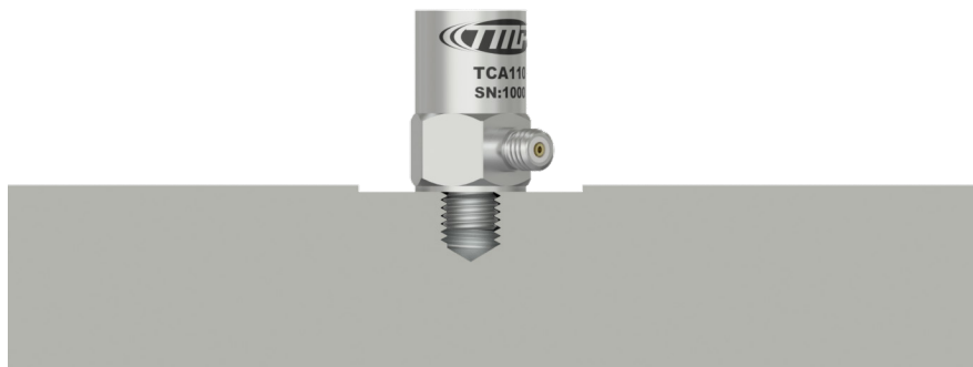
Figure 1. Stud Mounted Sensor