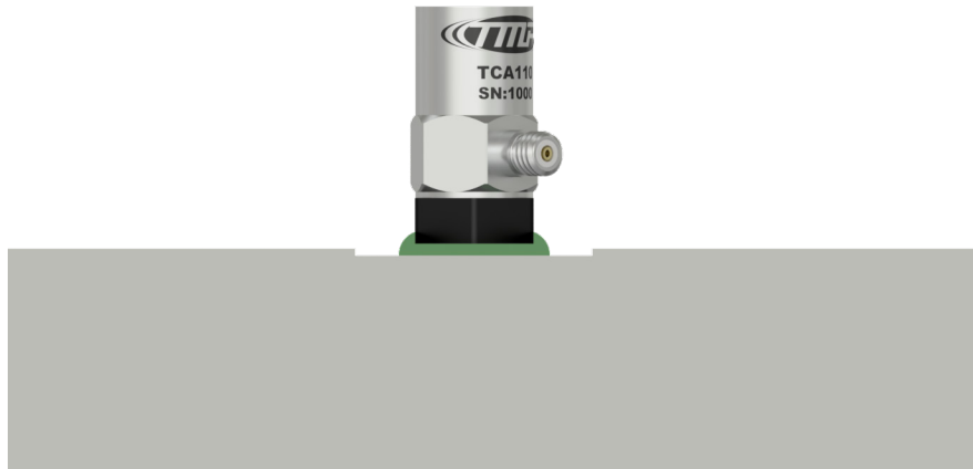
Figure 2. Adhesive Mounted Sensor