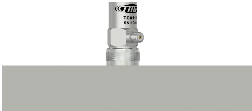
Figure 3. Magnetic Mounted Sensor